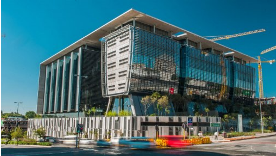
Alexander Forbes' headquarters took top honours at the 2014 AfriSam-Saia Award